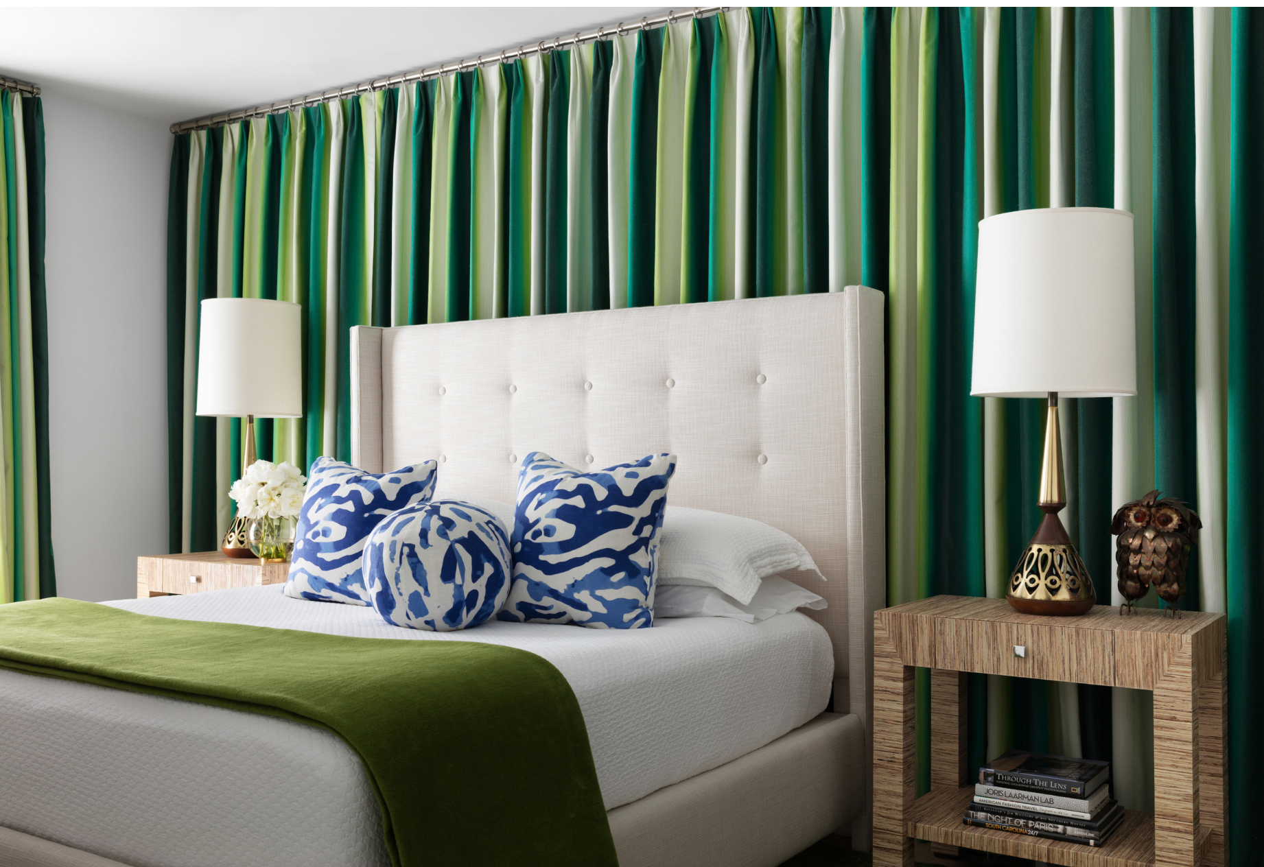
ABOVE | Floor-to-ceiling drapery panels (“Tahitian Stripe Rain Forest” by Chella Textiles) give the primary bedroom a luxe ambience. For practical considerations, the draperies also soften street noise and allow the bed to be centered on the wall rather than placed between windows. A platform bed upholstered in Kravet fabric is topped with abstract accent pillows. Vintage table lamps are from City Issue, with grasscloth nightstands from Bungalow 5.

“THE BEDROOM ALMOST FEELS LIKE WE’RE LIVING IN THE TREES. IT REMINDS US OF OUR VACATIONS TO TROPICAL PLACES.”