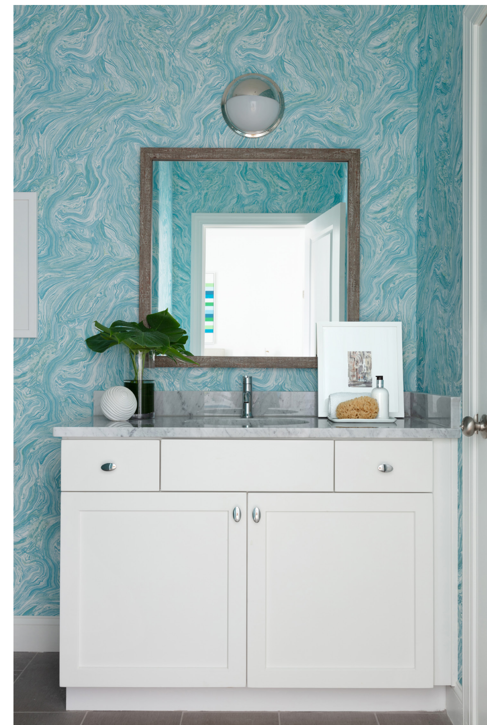
ABOVE | Marbled wallpaper by Thibaut dresses up this guest bathroom, with a polished Carrara marble countertop and custom framed mirror by Caroline Budd’s Picture Framing.