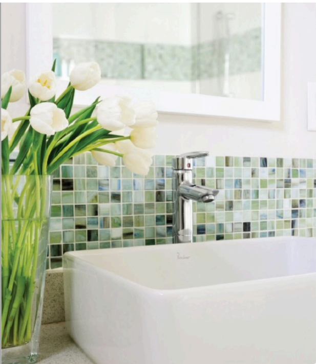
OPPOSITE: "Standard vanities give such a boxed-in look," interior designer Perry Walter says. Instead, he designed this painted white maple vanity, topped by quartz-surfacing, to increase the open floor space in the small bath. LEFT: Polished-chrome single-handle faucets and large vessel sinks provide the modern lines that define this bathroom.