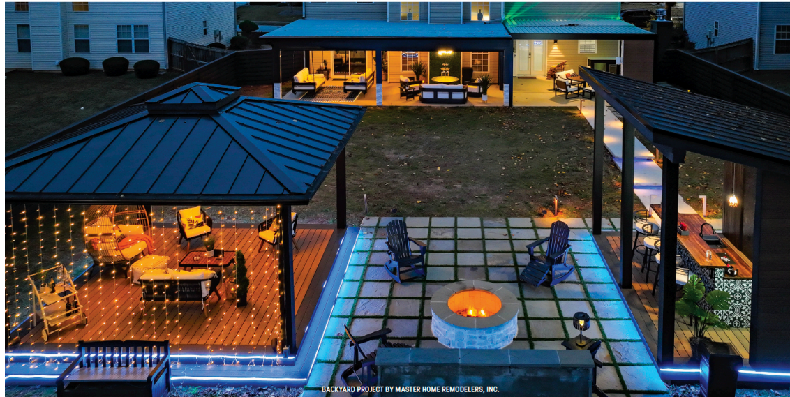
BACKYARD PROJECT BY MASTER HOME REMODELERS, INC.